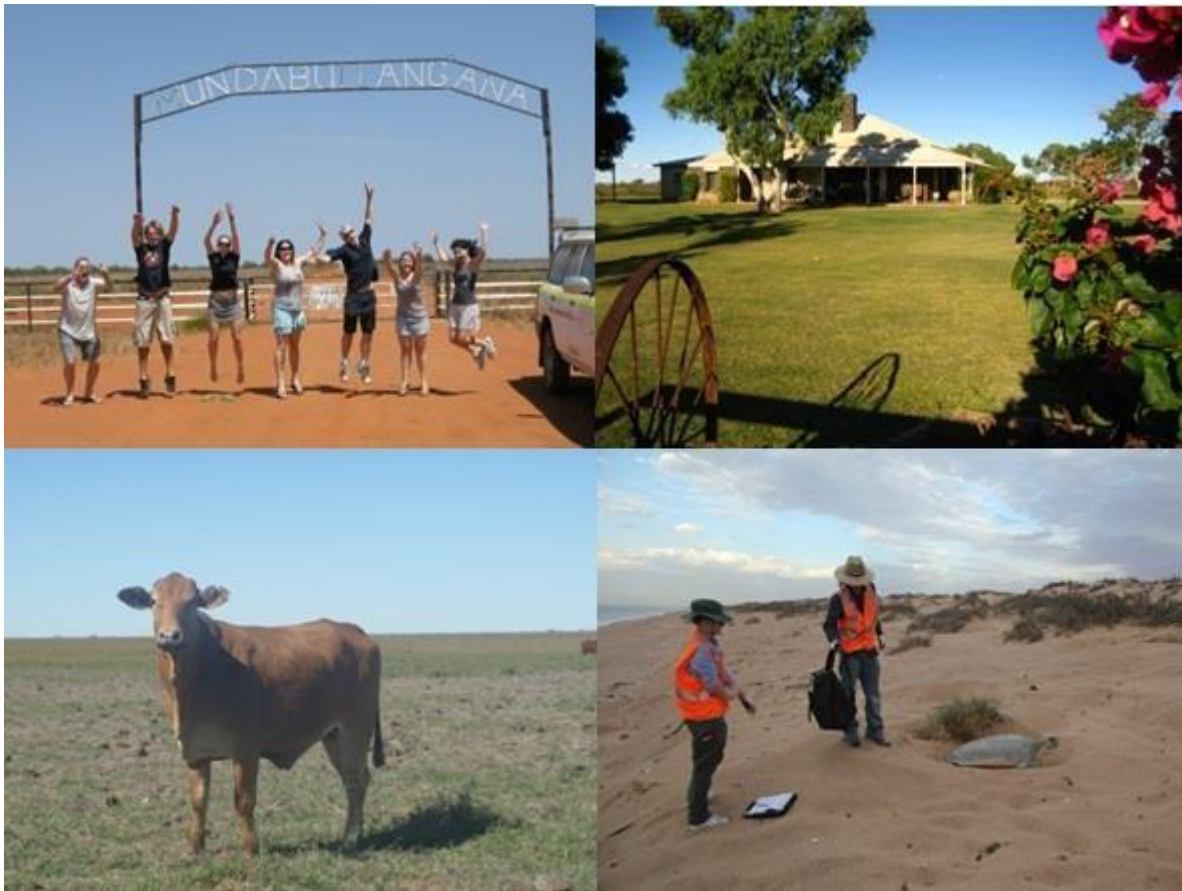
Figure 4: Volunteers at the entrance to MDA; station homestead; livestock; flatback turtle (Munda Main Beach).

Mundabullangana Station (MDA) is located on the Western Australian mainland approximately 60 km southwest of Port Hedland. It is a working station spanning approximately 500,000 acres and home to approximately 10,000 head of cattle. It is host to a significant flatback turtle rookery, located on the beaches to the north of the station. This population of flatback turtles appears to be discrete from the turtles found on Barrow Island, located approximately 280 km to the west.