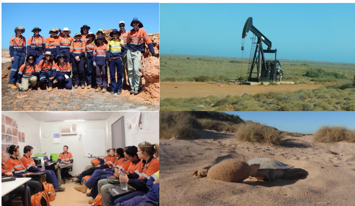
Figure 3: Taggers on an excursion at Barrow Island; Lufkin at Barrow Island; Taggers preparing for night survey on Barrow Island; nesting turtle at Yacht Club South beach.

Barrow Island is a 23,400-hectare island located 88 km from the north-west of Onslow. Western Australia's second largest island, it is a Class A Nature Reserve, providing habitat for 14 mammal species, more than 110 types of birds, 54 reptile species, and over 350 native plant species. Four species of marine turtles either nest on Barrow Island and/or forage in the waters surrounding the island.