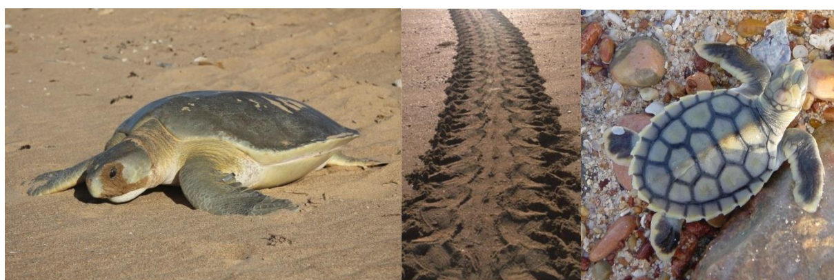
Figure 1: Adult flatback turtle; flatback turtle track; and flatback turtle hatchling.

It is estimated that approximately 10,000 flatback females nest each year in Australia. Mundabullangana and Barrow Island flatback populations are considered globally significant due to the size of their rookeries, with around 2,000 turtles nesting per year at each site (Pendoley et al. 2014). Flatback turtles generally breed every one to three years (average two years) and lay up to four clutches of around 50 eggs between October and February (in the Pilbara region of WA) in a nesting year (Pendoley et al. 2014). Peak nesting season at Barrow Island is between late November and January, with the peak nesting season at Mundabullangana occurring slightly earlier between early November and December. After an incubation period of approximately six weeks, the eggs hatch and the hatchlings immediately make their way to the ocean. Flatback turtles do not have an oceanic phase to their lifecycle, and instead remain on the continental shelf (Hamann et al. 2009). It is thought that females reach maturity at about 20 - 30 years of age, where they show nest site fidelity, generally returning to their natal (birth) beach or island to lay their eggs.