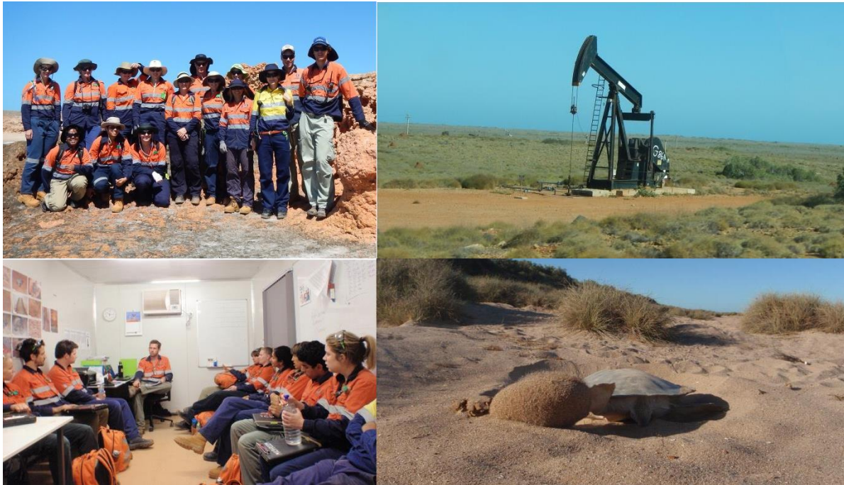
Figure 3: Taggers on an excursion at Barrow Island; Lufkin at Barrow Island; Taggers preparing for night survey on Barrow Island; nesting turtle at Yacht Club South beach.

Barrow Island is a 23,400-hectare island located 88 km from the north-west of Onslow. Western Australia's second largest island, it is a Class A Nature Reserve, providing habitat for 14 mammal species, more than 110 types of birds, 54 reptile species and over 350 native plant species. Four species of marine turtles either nest on Barrow Island and/or forage in the waters surrounding the island.