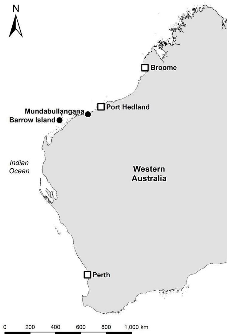
Figure 2: Location of Barrow Island and Mundabullangana and nearby town of Port Hedland.

Chevron Australia has operated an oilfield on Barrow Island since 1964. The Gorgon Gas Development, operated by Chevron Australia and in joint venture with ExxonMobil and Shell, were given approval to develop the Greater Gorgon gas fields, which contain 40 trillion cubic feet of gas. The gas is being piped to a LNG processing and shipping facility which has been constructed on the east coast of Barrow Island. Chevron Australia is committed to protecting the conservation and biodiversity values upon Barrow Island, and provides full support of the marine turtle research program upon Barrow Island. Part of this research program involves the Flatback Turtle Tagging Program that has been conducted by Pendoley Environmental since 2005/06 as part of baseline studies to assess the status and monitor the nesting flatback turtle populations on the east coast of Barrow Island. Equivalent studies have also been undertaken at a reference beach located on the mainland at Mundabullangana Station, west of Port Hedland. Figure 2 shows the location of the two sites in WA, and the closest major town.